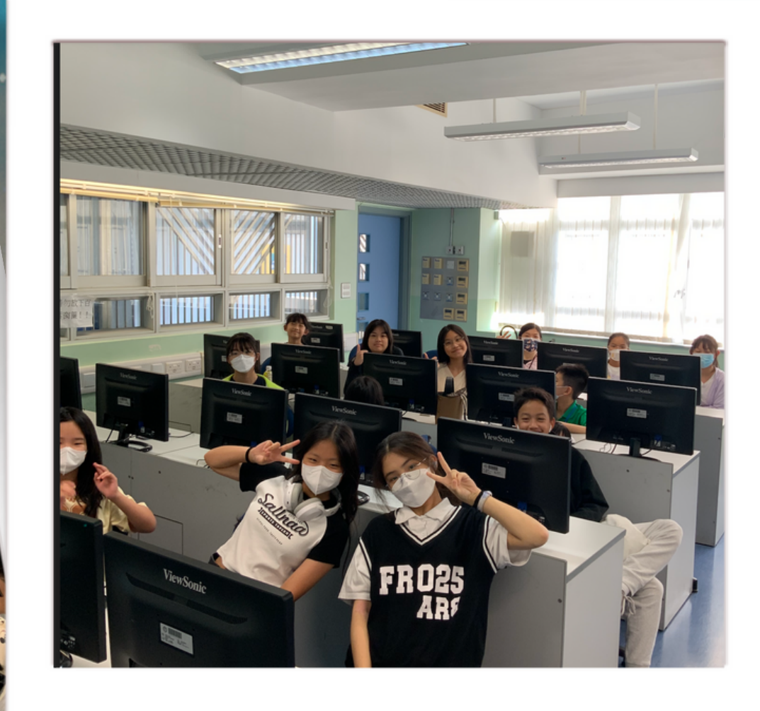
12 April, 23